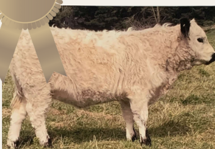
Mountain View Pearl Breeder: Nick Rattanong D.O.B 29/8/2021