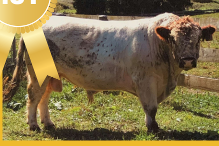
Wayby jeffers Breeder: Beth McVerry D.O.B 19/5/2019