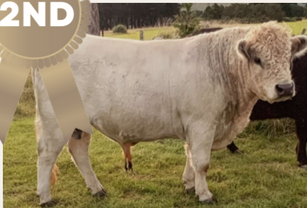
Penny Plains Thor Breeder: Karen Futter D.O.B 26/9/2019