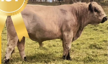
Mountain View Sydney Breeder: Nick Rattanong D.O.B 31/8/2019