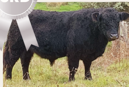
Wayby Axial Breeder: Tracy Wood D.O.B 7/11/2020