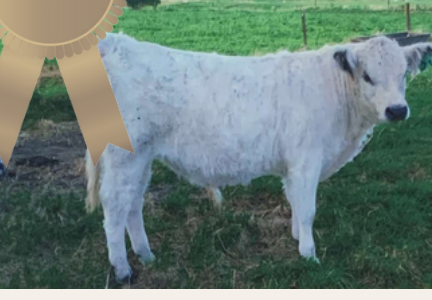
Corinium Arnie Breeder: Virginia Darlow D.O.B 23/8/2021