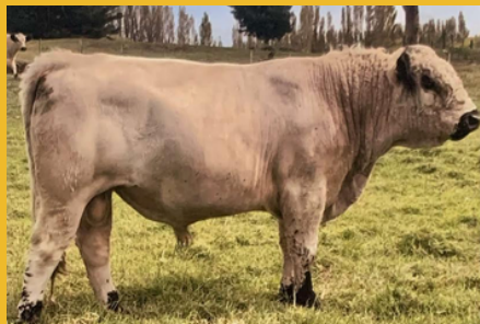
Mountain View Sydney Breeder: Nick Rattanong D.O.B 31/8/2019