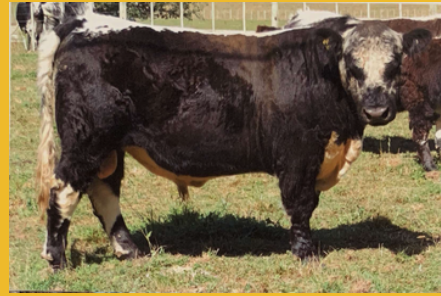
Cherrybank Pride Breeder: Beth McVerry D.O.B 18/8/2020