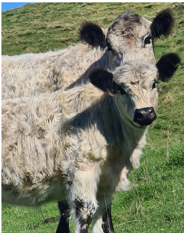
Photo: Proud mother and daughter.