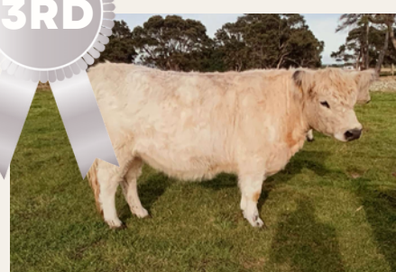
Penny Plains Pascha Breeder: Karen Futter D.O.B 27/9/2019