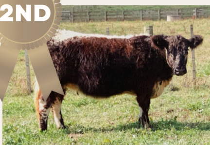
Cherrybank Silvermist Breeder: Beth McVerry D.O.B 4/6/2020