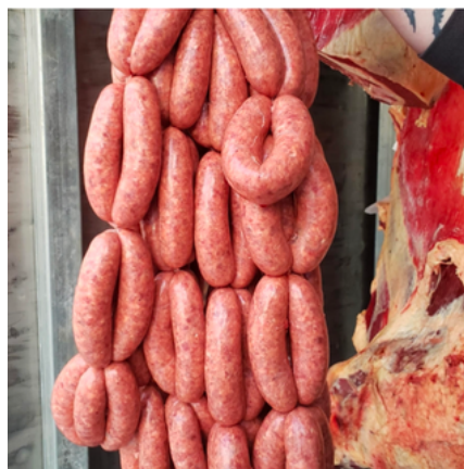
Our first batch of pure Galloway beef, bacon & maple sausages