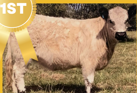
Mountain View Poppy Breeder: Nick Rattanong D.O.B 6/10/2020