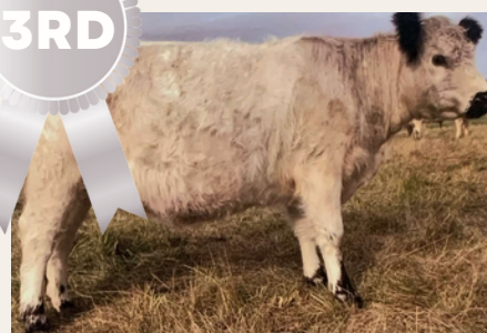
Mountain View Prudence Breeder: Nick Rattanong D.O.B 14/8/2020