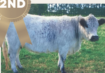
Corinium Josie Breeder: Virginia Darlow D.O.B 28/7/2019