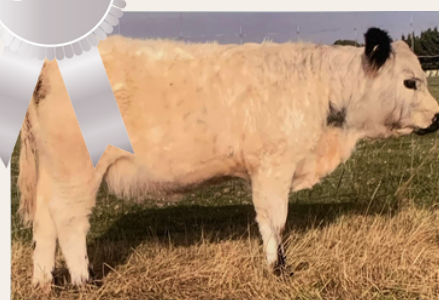
Mountain View Sacha Schleek Breeder: Nick Rattanong D.O.B 28/10/2021