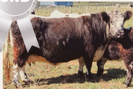
Cherrybank Panda Breeder: Beth McVerry D.O.B 10/6/2012