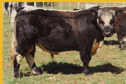
Cherrybank Pride Breeder: Beth McVerry D.O.B 18/8/2020