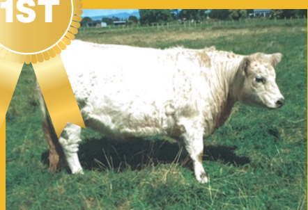
Corinium Jinx Breeder: Virginia Darlow D.O.B 27/10/2019