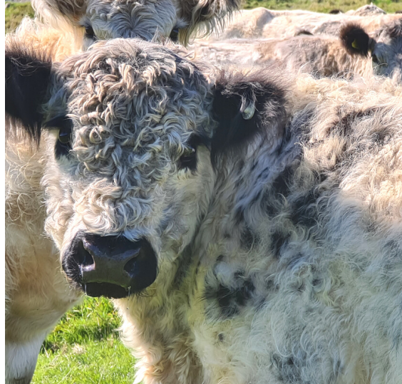
Photo: Rising one year bulls looking forward to a harem at a dairy farm.