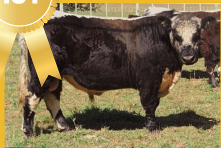
Cherrybank Pride Breeder: Beth McVerry D.O.B 18/8/2020