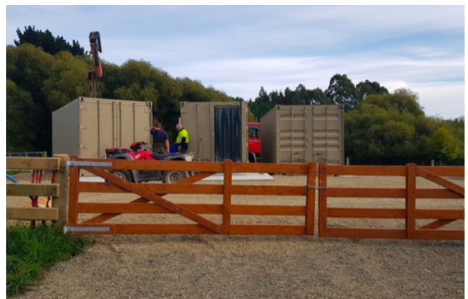
Our Butchery- the last container arriving- March '22