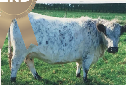
Corinium Fliss Breeder: Virginia Darlow D.O.B 21/10/2017