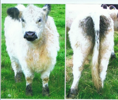
Pinzridge White Bling Bridget Lowry