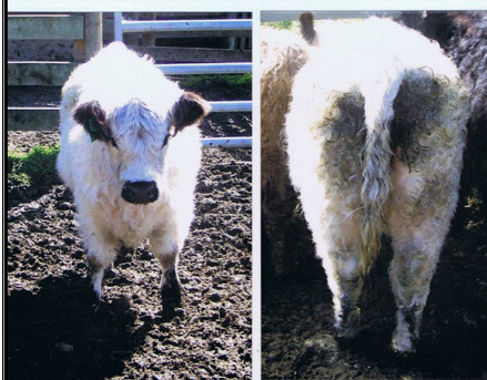
Pinzridge Bubblegum Bridget Lowry