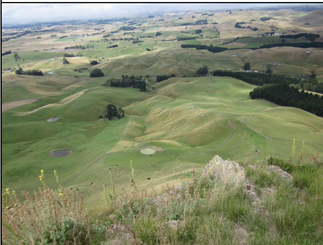
(This a view from the top of the hill lime rock at the back of the farm)

Their calves were either well marked White Galloways or completely black. The first few born, the heifers were white and the bulls were black. I thought it could be like red Shaver poultry and colour sexed. But further into the calving this pattern did not continue, however, it came out about 70% of the bulls, now steers, are black.