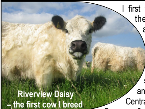
Riverview Daisy – the first cow I breed

I first fell in love with these beautiful animals in a paddock while staying in Te Kauwhata, and then again after seeing a cow and her calf at the Central District Field Days. So when the