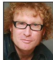
Patron Te Radar