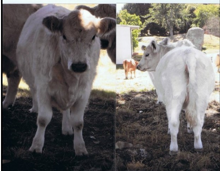
Tootaranui Ivory Claudia Forsythe